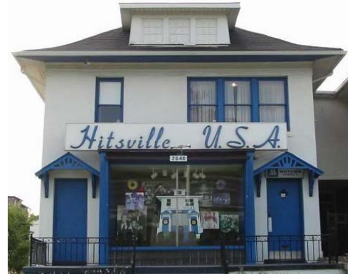
The original Motown recording studio and offices in Detroit, MI :: HITSVILLE USA

Remember The Temptations, The Supremes, The Marvelettes & Smokey Robinson? Those are just some of the artists that are showcased live on stage --- by an all-star cast of musicians and vocalists (9 to 12 pieces depending on your requested configuration) - all being led by former Motown recording artist, and former lead singer of The Temptations from 1975-83, Mr. Glenn Leonard. Sit back and enjoy the show, relive all the memories on video screens along with our narrator - and see and hear all the action live on stage!